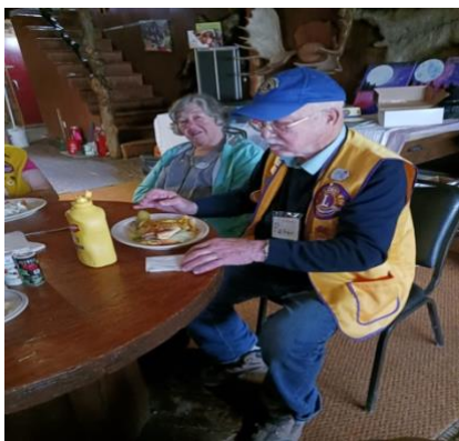
Dinner at the Grizzly