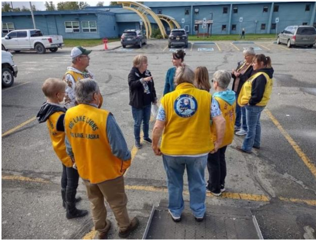
Team getting instruction at Big Lake Elementary