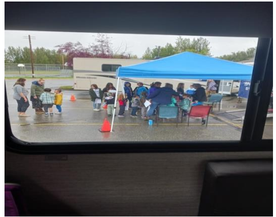
Rain at Big Lake Elementary