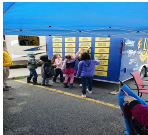
The kids found their clubs banner.